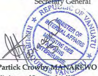
Hon. Partick Crowby MANAREWO Minister of Internal Affairs