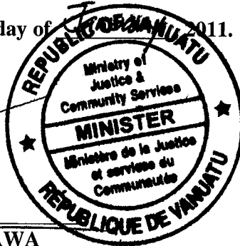
Honourable IOANE SIMON OMAWA Minister of Justice and Community Services